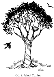
C.J. S. Paluch Co., Inc.